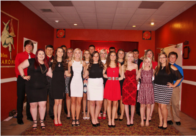
Senior Class Members